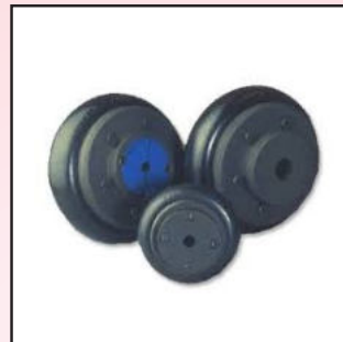
Tyre per ISO 14691, BS 4235