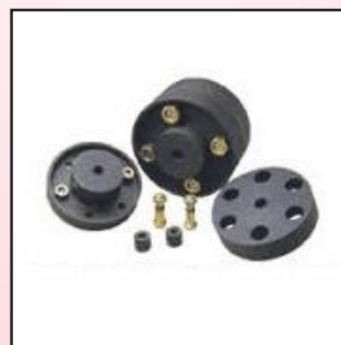
Pin Bush per IS 2693