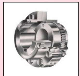
Gear Full, Half Rigid per IS 12405