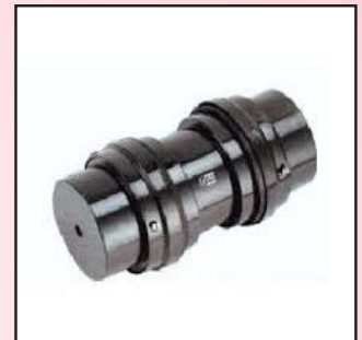
Jaw Spacer per BS 4235