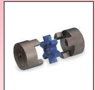
Star Spider as per BS 3170